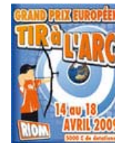
EMAU Grand Prix (1st leg) 14-18 April 2009